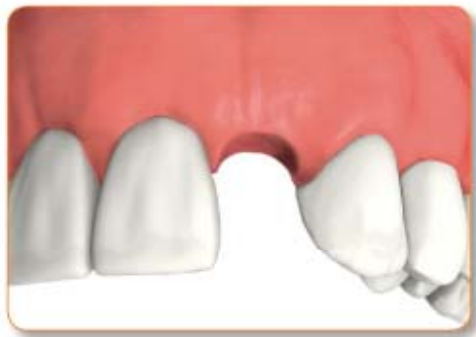
single tooth missing

A missing tooth can be replaced by a dental implant without altering the healthy adjacent teeth.