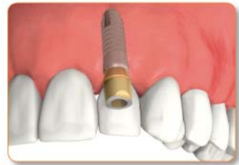
abutment and final crown are custom made to match your existing teeth