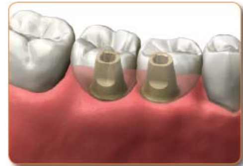
abutments and final crowns are custom made to match your existing teeth