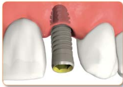
the implant is placed in the bone beneath the gum